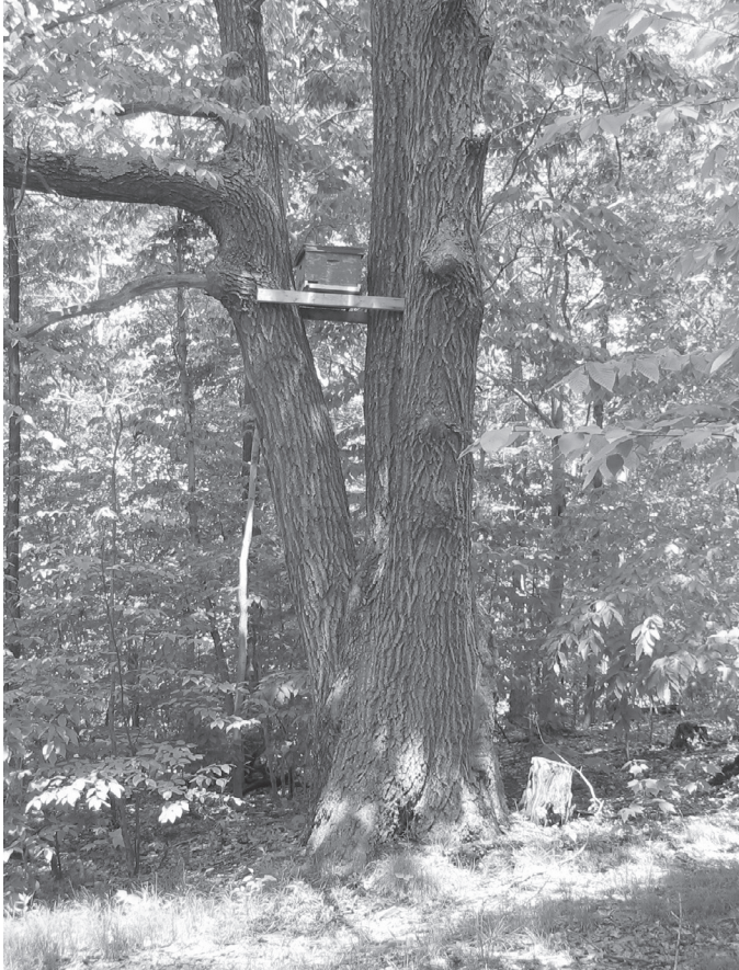
Figure 1. One of five bait hives installed in trees in the Arnot Forest to attract swarms and so provide feral colonies living in movable-frame hives. Installation shown is typical: hive mounted some 4 m off the ground and with entrance opening reduced to 16 cm 2 and oriented to south.

not by themselves indicate a living colony within – they could be robber bees or scout bees, plundering or inspecting the nest of a dead colony – so I used the criterion of the presence of pollen foragers as my indicator of a live colony. The nests of colonies that had died were kept in the inspection program to provide data on the occurrence of nest reoccupation. The May 1 inspection preceded the swarming season for the Ithaca area (Fell et al., 1977), so all colonies alive at that time were assumed to have survived the winter. The mid-June inspection served to check for late spring mortality among colonies that survived winter. The October 1 inspection provided data on nest reoccupation and colony survivorship for the preceding summer. A prior study of the demography of feral colonies in central New York State (Seeley, 1978) found that